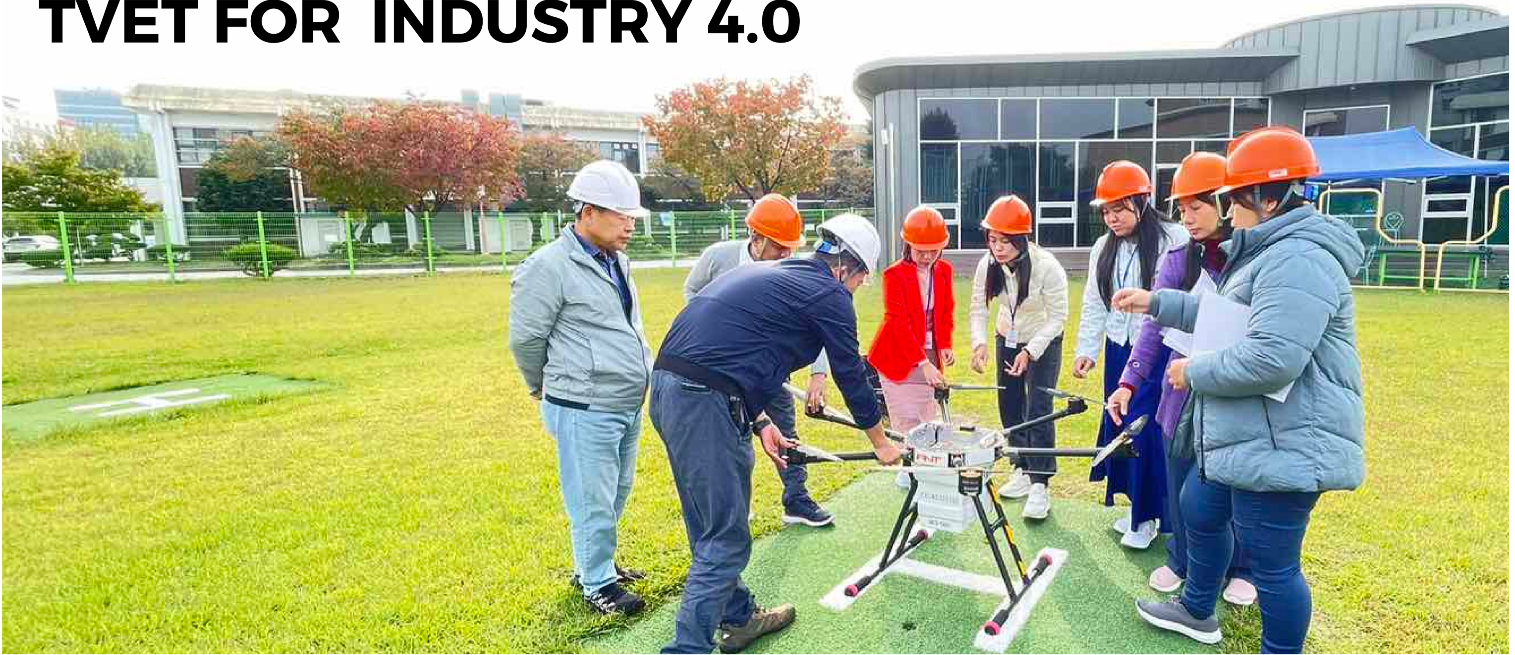
Training of 6 Myanmar TVET teachers in ROK for Drone Technology and IoT

In the age of Industry 4.0, Artificial Intelligence (AI), Internet of Things (IoT) and Drone technologies get into a wide range of applications. While the integration of contemporary technologies into processes can increase performance, efficiency, productivity, connectivity, accuracy, security, and therefore improve living standard of society, wage and income, it can also cause inequality between economic sectors, regions, urban and rural areas as well as between groups of labors due to skill gaps.